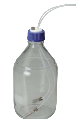
Opti-Cap™ Kit with bottle