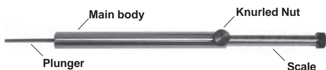
Figure 1: The inlet liner packing tool.

The inlet liner packing tool (Figure 1) is designed to pack the wool in the same position inside the liner to promote reproducibility from liner to liner. The tool also makes installation of the wool easy and hassle-free. The inlet liner packing tool is designed to be used with inlet liner IDs greater than 2mm.