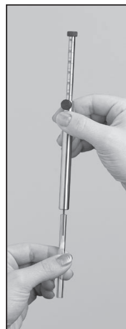
Figure 3: Set the packing material to proper distance using the liner packing tool.

Call Technical Service at 800-356-1688 or 814-353-1300, ext. 4 (or your local Restek representative) if you have any questions about this product or any other Restek product.