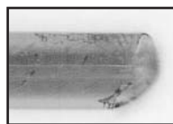
A bad column cut.