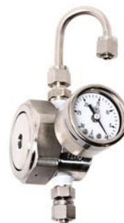
Miniature Air Sampling Kit