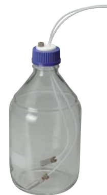
Opti-Cap™ Kit with bottle