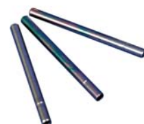
Stainless Steel, Unconditioned